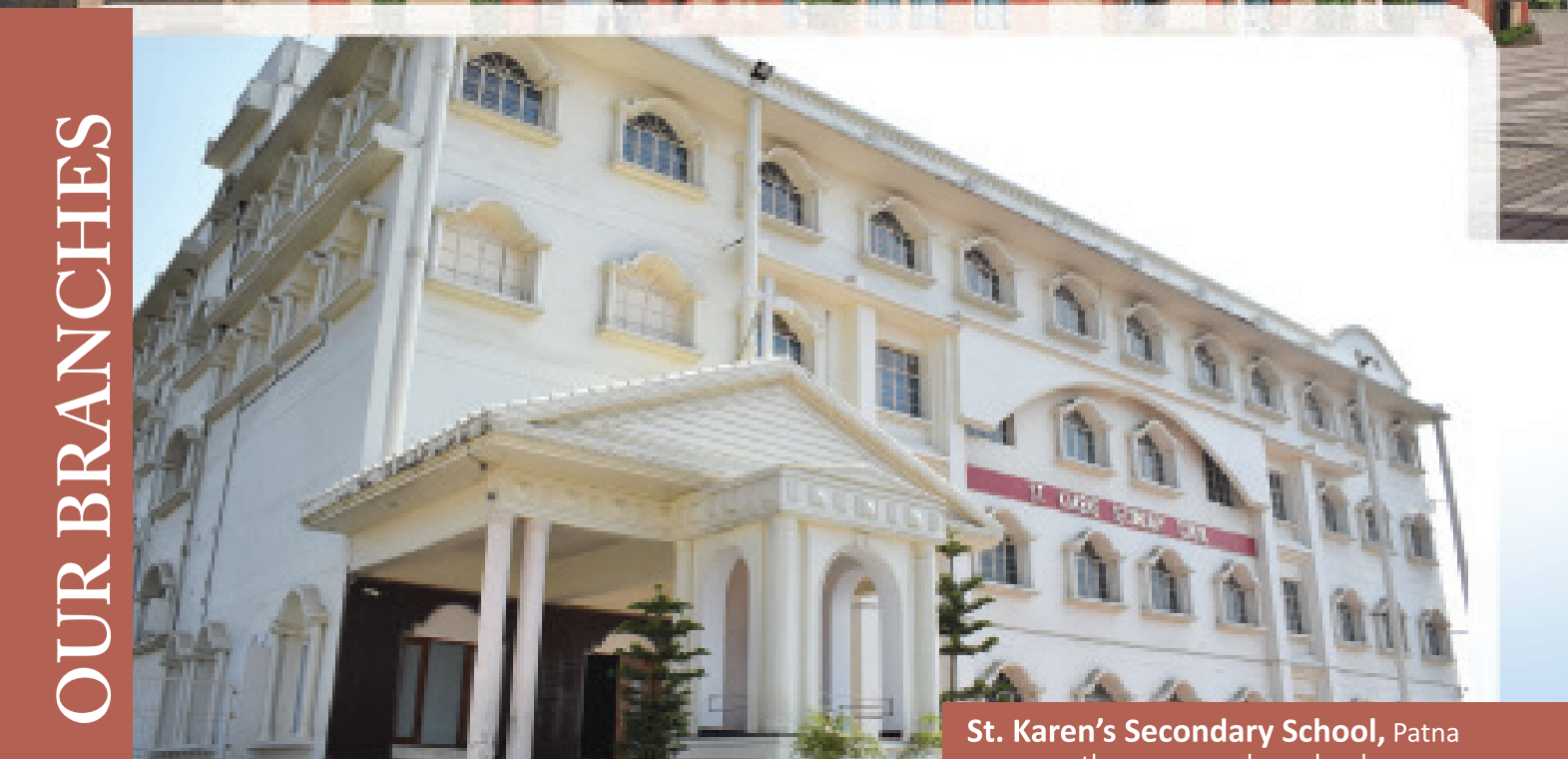
St. Karen's Secondary School, Patna www.stkarenssecondarieschool.com