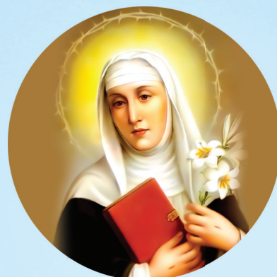
St. Catherine of Siena The Patron Saint of our School

A HAPPY SCHOOL WHERE CHILDREN ARE TAUGHT WITH LOVE, CARE AND UNDERSTANDING.