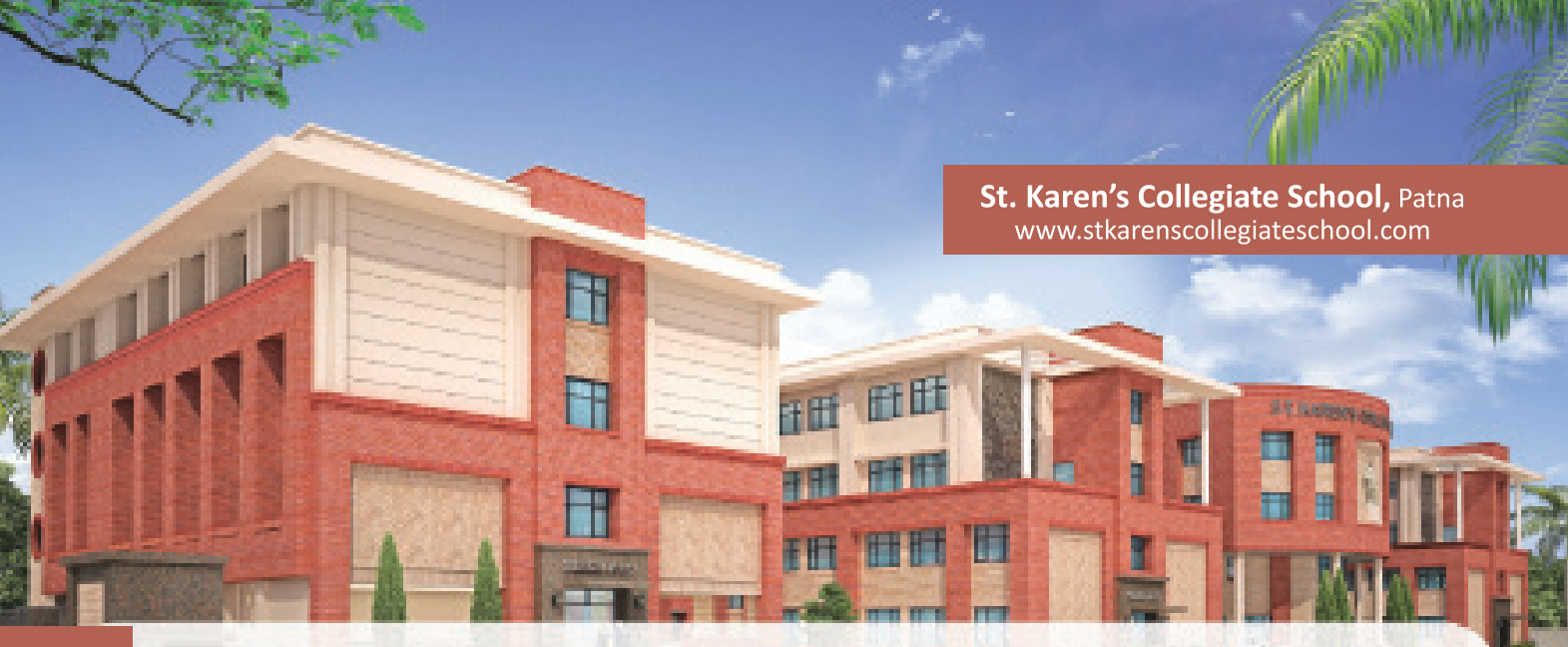
St. Karen's Collegiate School, Patna www.stkarenscollegiateschool.com